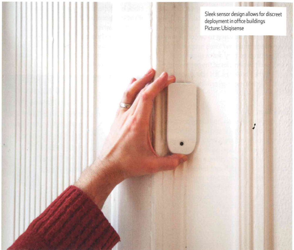
Sleek sensor design allows for discreet deployment in office buildings

"Years ago, this was a big challenge," he continues. "The IT industry is still at the forefront of driving the standards – and especially the importance of cyber protection. As more and more 'edge' devices connect to smart buildings, including employees' BYOD options, ensuring cyber protection to the corporation and individual is key."